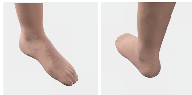
Closed toe option